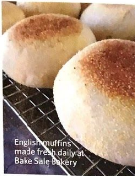
English muffins made fresh daily at Bake Sale Bakery

toast-style bun. > IRONSIDE FISH & OYSTER 1654 India St., Little Italy, 619.269.3033