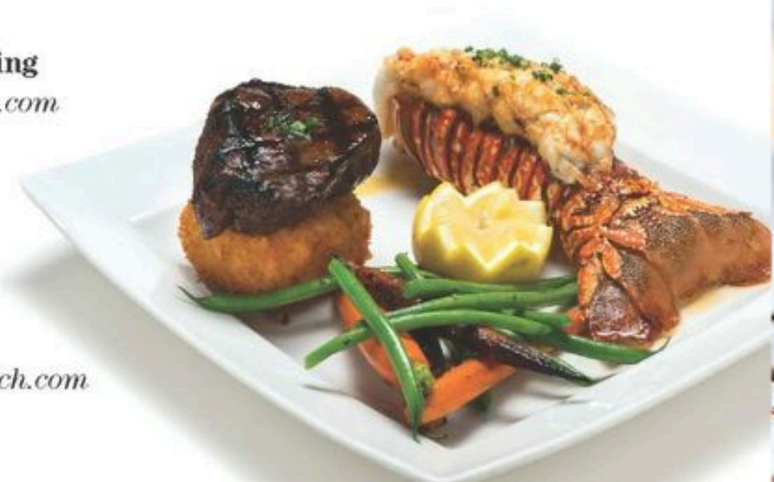
Pacific Coast Grill