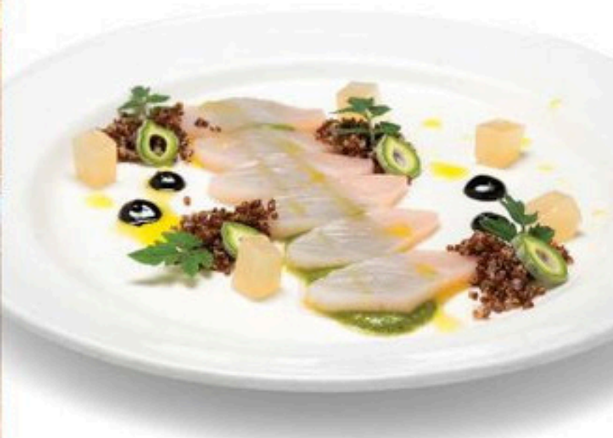
Wrench & Rodent Seabastropub